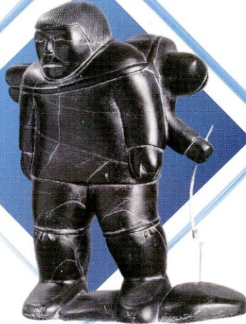
Charlie Sivuarapik Puvirnituq, PQ

Come visit this internationally recognized collection of Indigenous art!