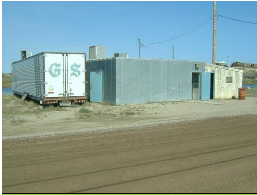
The Iqalukpik Fish Plant (Arctic Char) Commercial Fishery