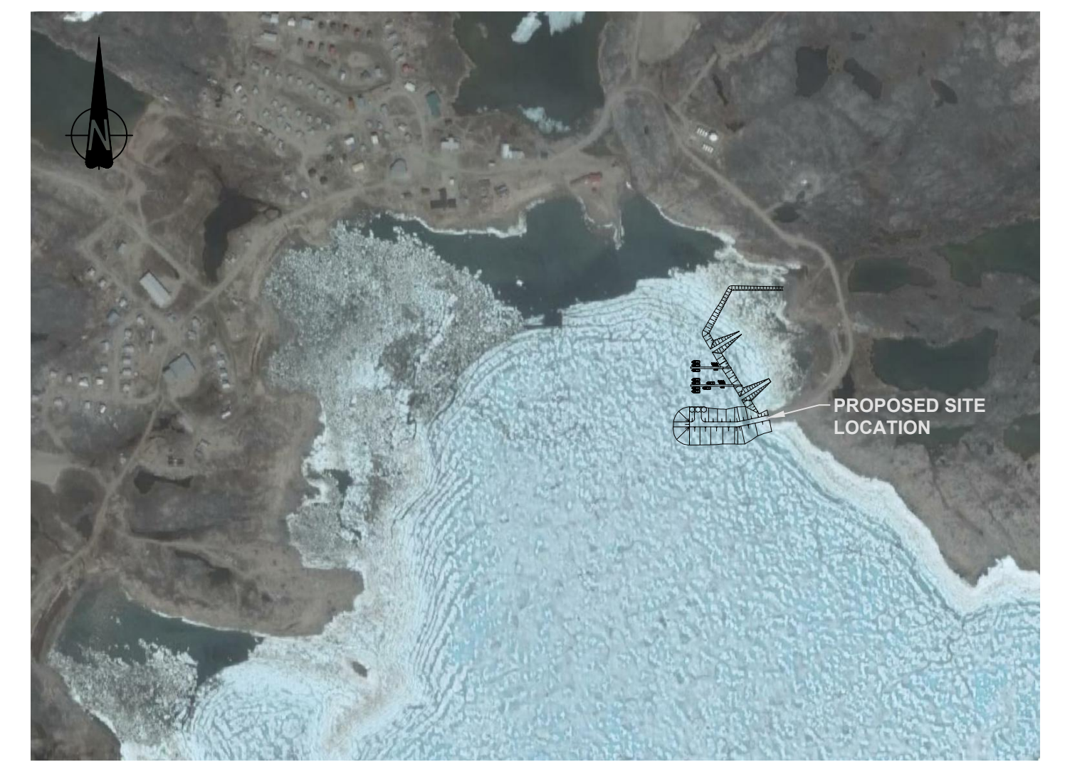
KEY PLAN NTS